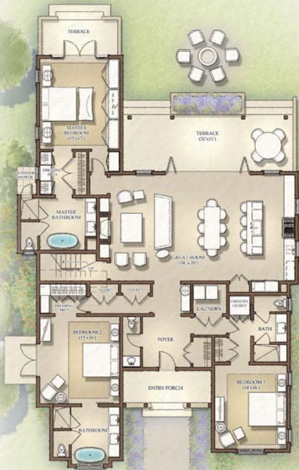
4-BEDROOM RESIDENCE (2-STORY) FIRST FLOOR