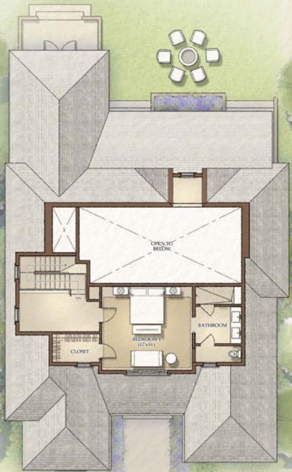
4-BEDROOM RESIDENCE (2-STORY) SECOND FLOOR